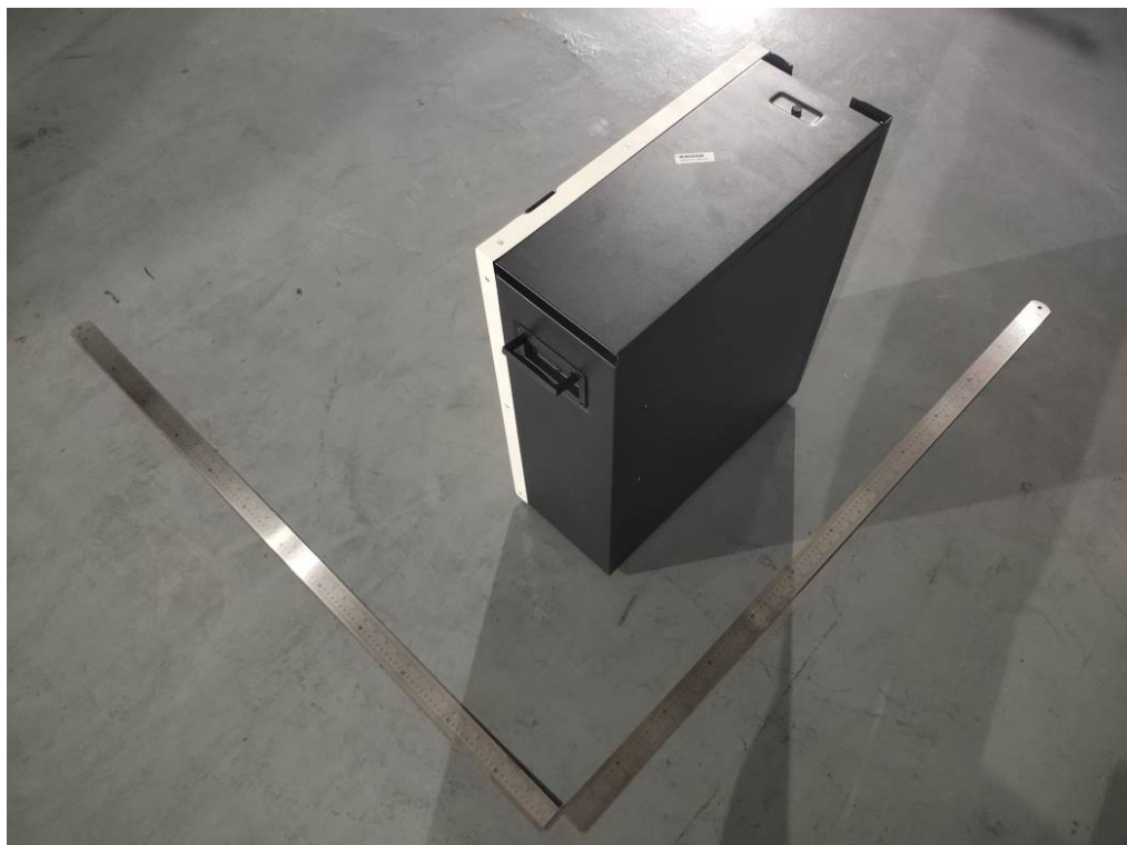
Figure 2 Overall view II of battery (电池图II)