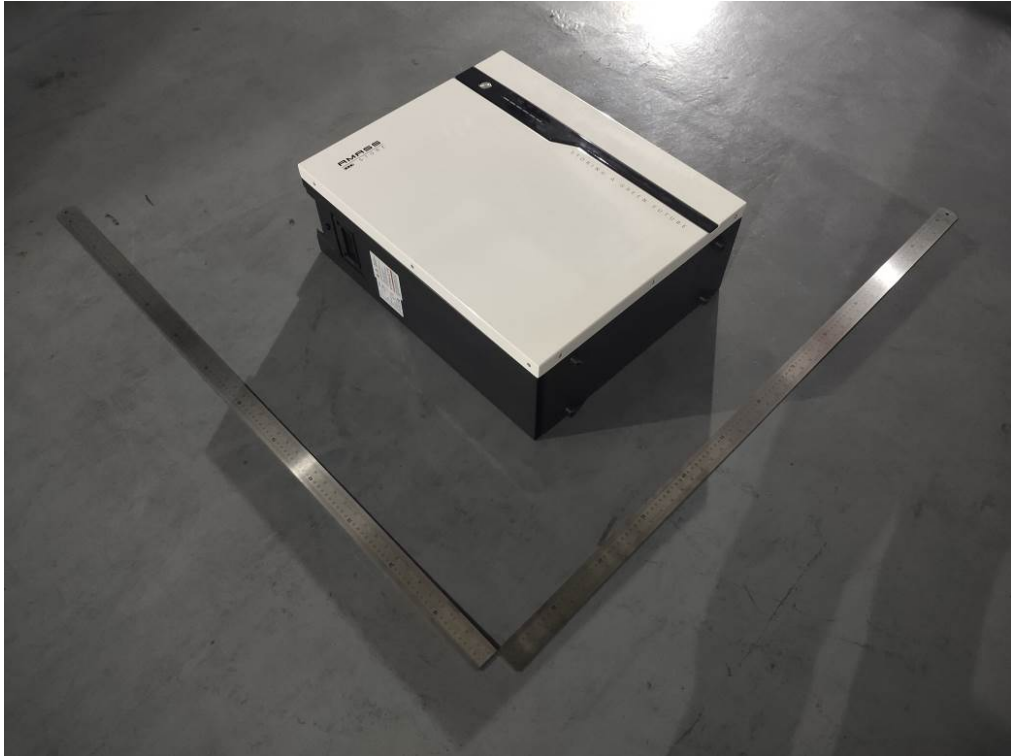
Figure 1 Overall view I of battery (电池图I)