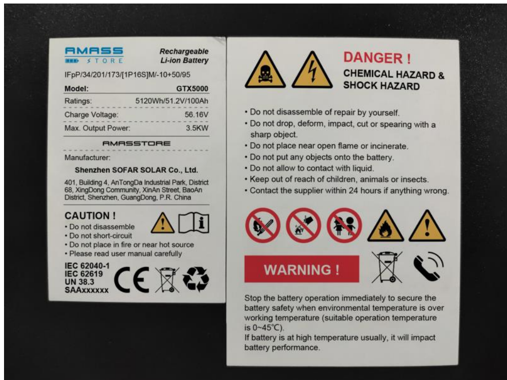
Figure 4 Battery Label (电池标签)